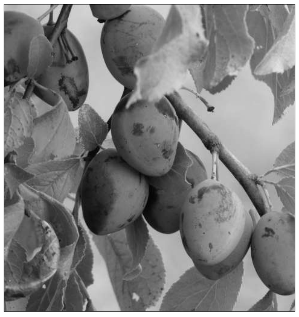
Abbots Morton, Rous Lench, Church Lench & Harvington www.archbenefice.org.uk