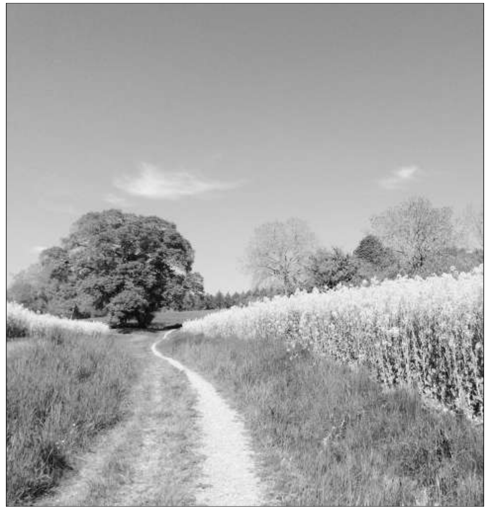
Abbots Morton, Rous Lench, Church Lench & Harvington www.archbenefice.org.uk