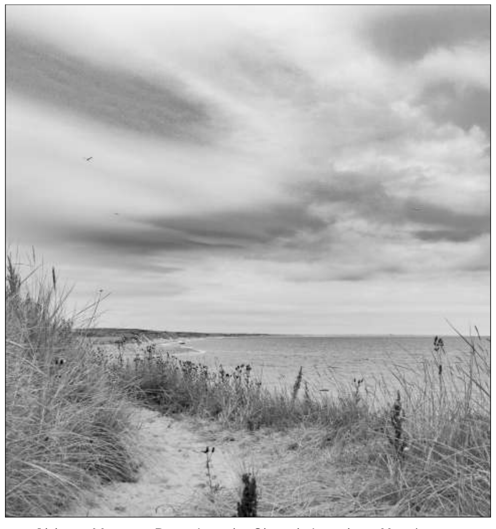
Abbots Morton, Rous Lench, Church Lench & Harvington www.archbenefice.org.uk